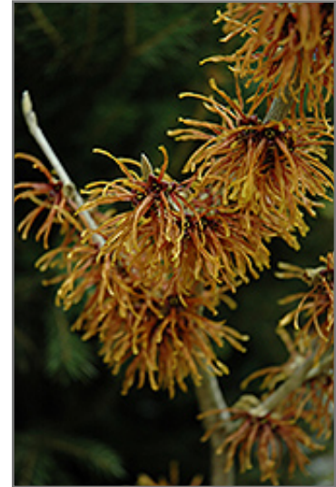
Jelena Witchhazel flowers

Jelena Witchhazel is recommended for the following landscape applications;