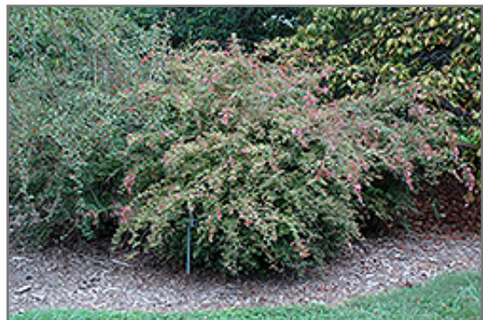
Edward Goucher Abelia in bloom