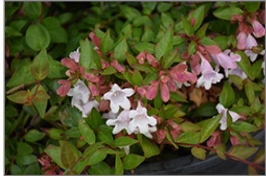
Edward Goucher Abelia flowers

This shrub will require occasional maintenance and upkeep, and should only be pruned after flowering to avoid removing any of the current season's flowers. It is a good choice for attracting birds, bees and butterflies to your yard, but is not particularly attractive to deer who tend to leave it alone in favor of tastier treats. It has no significant negative characteristics.