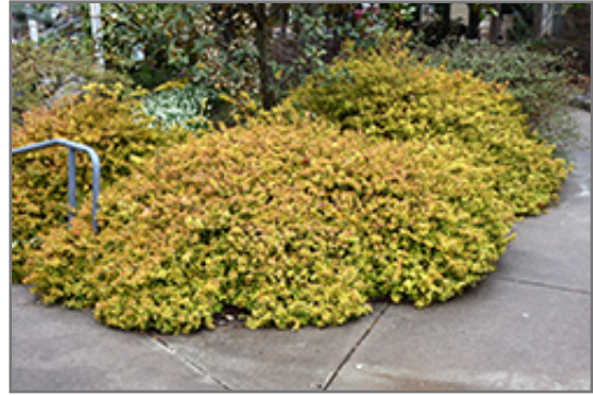
Kaleidoscope Abelia

Kaleidoscope Abelia will grow to be about 30 inches tall at maturity, with a spread of 4 feet. It tends to fill out right to the ground and therefore doesn't necessarily require facer plants in front. It grows at a slow rate, and under ideal conditions can be expected to live for approximately 30 years.