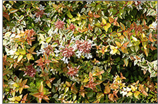
Kaleidoscope Abelia flowers

This shrub will require occasional maintenance and upkeep, and should only be pruned after flowering to avoid removing any of the current season's flowers. It is a good choice for attracting birds, bees and butterflies to your yard, but is not particularly attractive to deer who tend to leave it alone in favor of tastier treats. It has no significant negative characteristics.