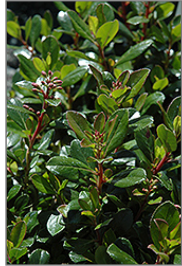
Pink Princess Escallonia foliage

This shrub does best in full sun to partial shade. It does best in average to evenly moist conditions, but will not tolerate standing water. It is not particular as to soil type or pH, and is able to handle environmental salt. It is somewhat tolerant of urban pollution. This particular variety is an interspecific hybrid.