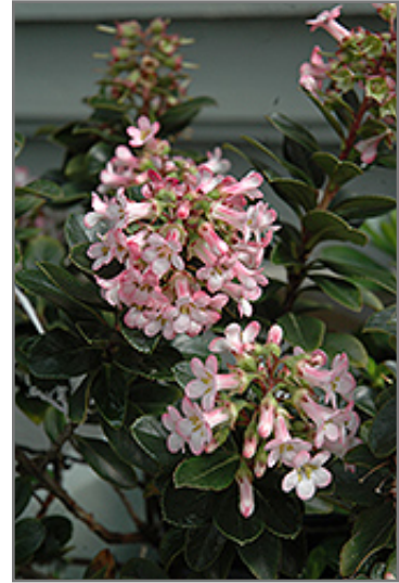
Pink Princess Escallonia flowers

Pink Princess Escallonia is recommended for the following landscape applications;