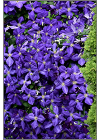
Jackmanii Clematis in bloom