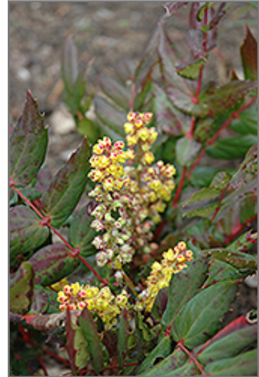
Oregon Grape Holly flowers

Oregon Grape Holly is a multi-stemmed evergreen shrub with a ground-hugging habit of growth. Its average texture blends into the landscape, but can be balanced by one or two finer or coarser trees or shrubs for an effective composition.