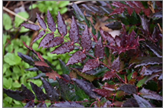
Oregon Grape Holly foliage