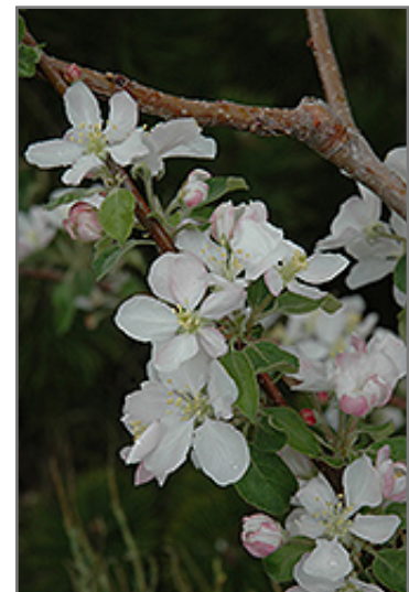
Pink Lady Apple flowers